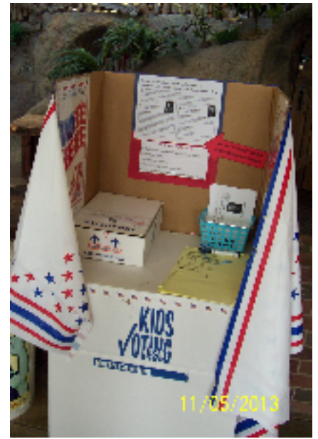
Kids Voting was active in the recent municipal elections