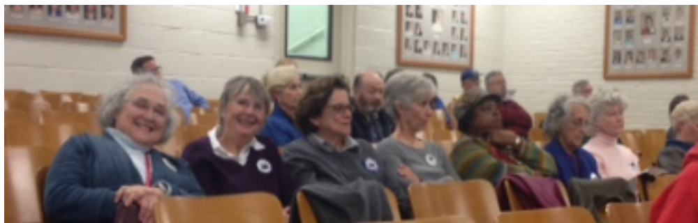
Civics 102 started with dinner at Mrs. G and Me and then moved to the monthly Board of Education meeting