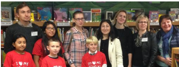
Open World Visit