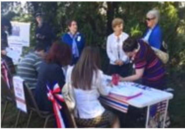
Registering new voters at the New Citizen Day at Carl Sandburg