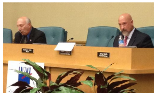
Candidates for Henderson County Sheriff