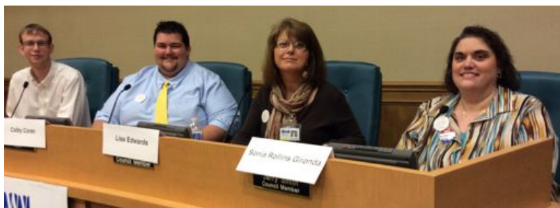
Candidates for Henderson County School Board