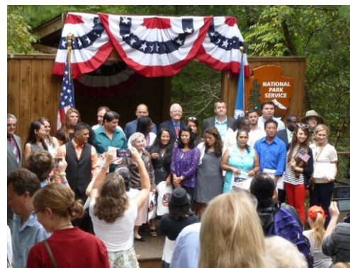
New Citizens at Carl Sandburg Ceremony

EAD (employment authorization document) is the work permit card that is issued with the DACA. DACA refers to Deferred Action for Childhood Arrivals. President Obama initiated the policy in June, 2012, and those eligible were