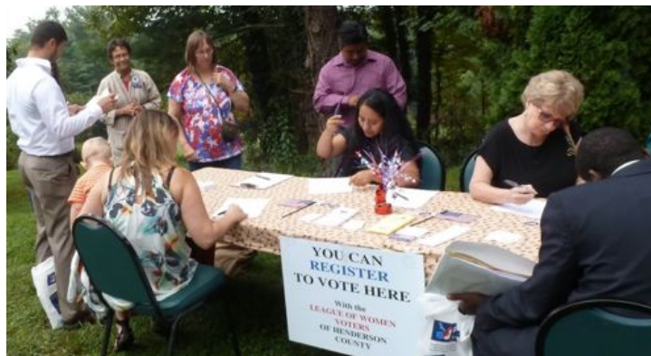
League members registered new American Citizens after the ceremony at Carl Sandburg Citizenship Day