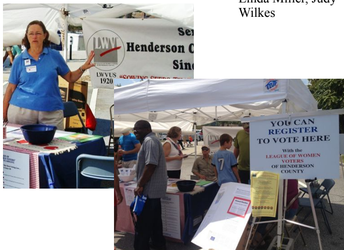
During Apple Festival members registered voters