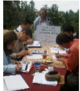
Our members helped new Citizens register to vote after their Naturalization Ceremony