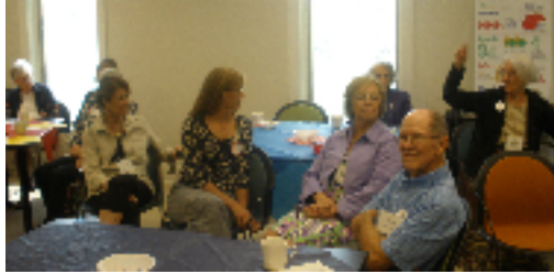
Members and guests at the Sundaes on Sunday