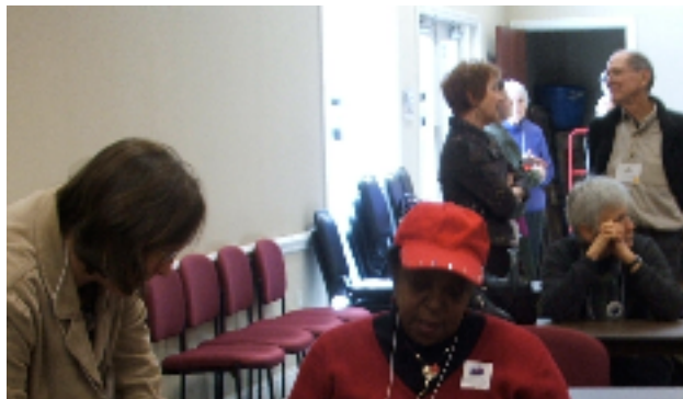
Members network before the meeting