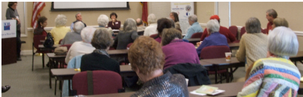
Members gathered to talk with our presenters on issues of media and the First Amendment